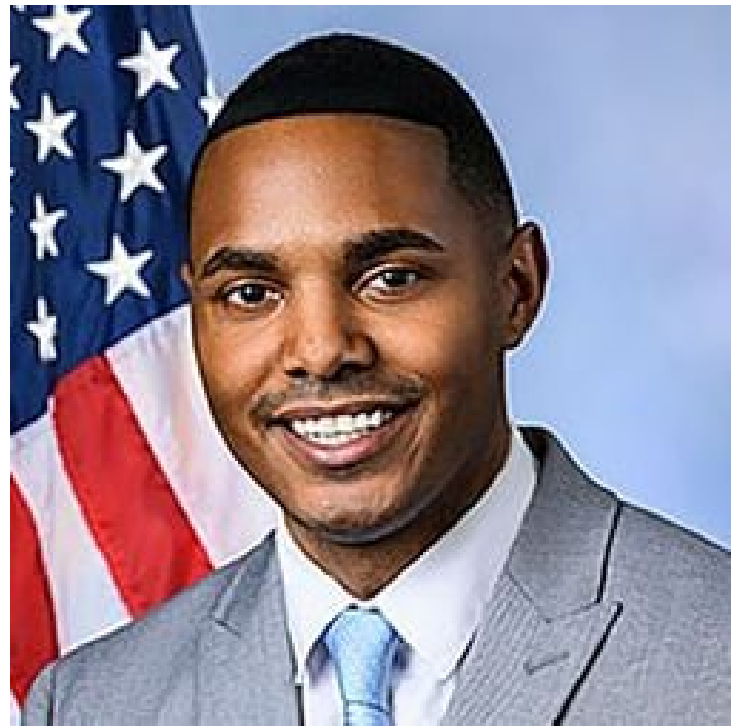
Ritchie Torres Congressman U.S. Congress