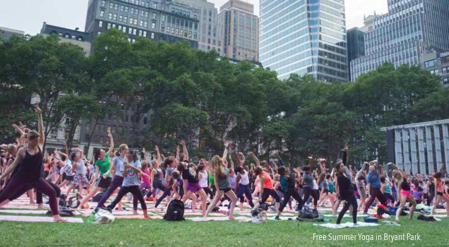
Free Summer Yoga in Bryant Park