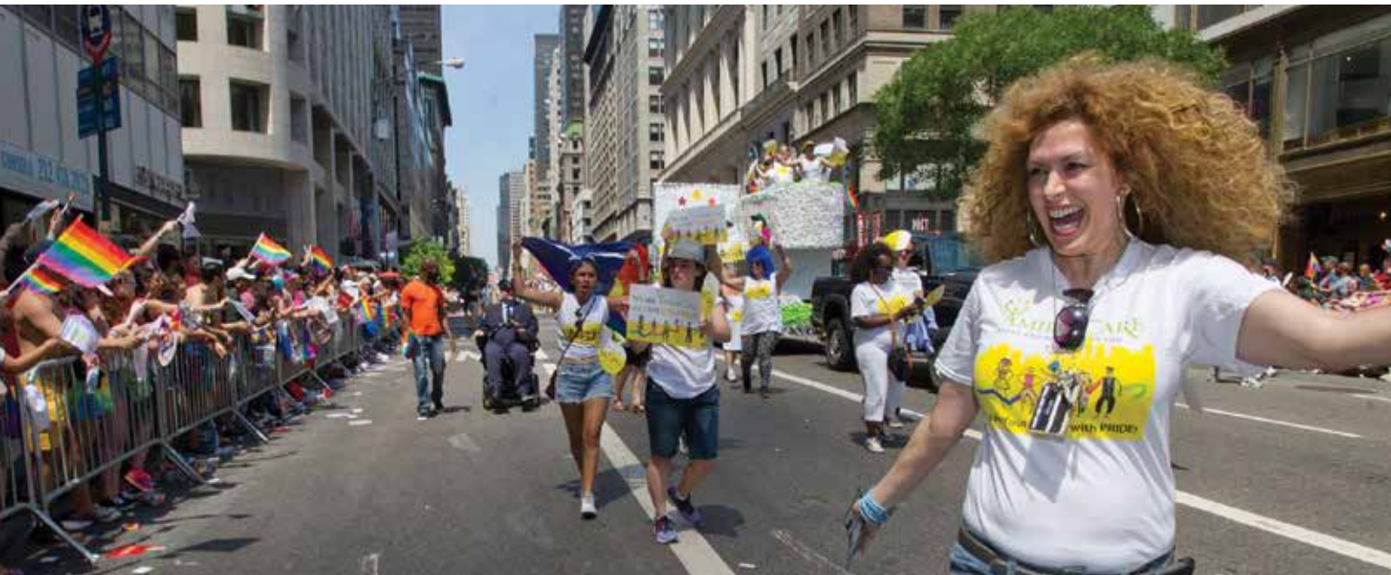
Amida Care members and staff rode our float high atop Fifth Avenue and danced their way down the 2-mile route from Midtown to the West Village.