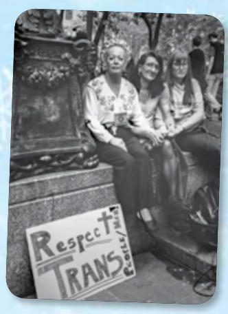
Luis Carle © 2018